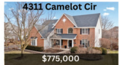
4311 Camelot Cir