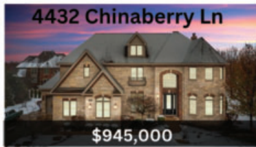
4432 Chinaberry Ln