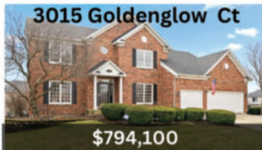
3015 Goldenglow Ct