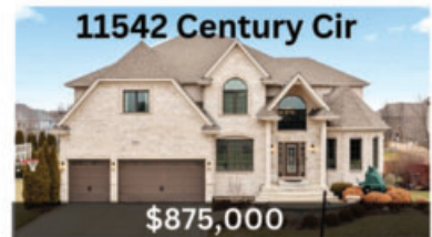
11542 Century Cir