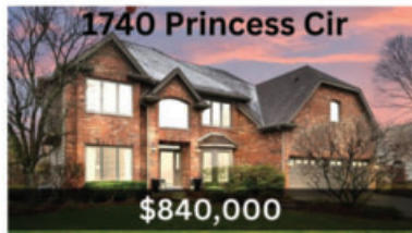
1740 Princess Cir