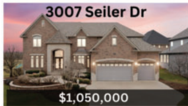
3007 Seiler Dr